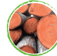
MAHAGONY HARVEST: 10 YEARS ACCOMMODATION: 30 YEARS