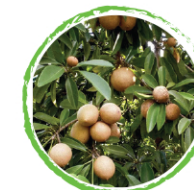
CHIKOO HARVEST: 3 YEARS YIELDING: 15 YEARS