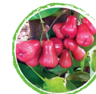
WATER APPLE HARVEST: 5 YEARS YIELDING: 20 YEARS