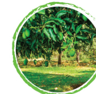
MANGO HARVEST: 15 YEARS YIELDING: 12 YEARS