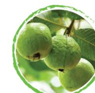
GUAVA HARVEST: 3 YEARS YIELDING: 15 YEARS