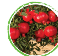
POMEGRANITE HARVEST: 3 YEARS YIELDING: 15 YEARS