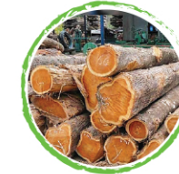
TEAK WOOD HARVEST: 15 YEARS ACCOMMODATION: 30 YEARS