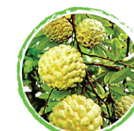
CUSTARD APPLE HARVEST: 3 YEARS YIELDING: 15 YEARS