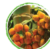
ARCANUT HARVEST: 3 YEARS YIELDING: 15 YEARS