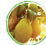
JACKFRUIT HARVEST: 15 YEARS YIELDING: 15 YEARS