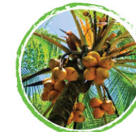
COCONUT HARVEST: 15 YEARS YIELDING: 12 YEARS